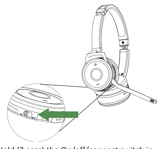
Hold (2 secs) the On/off/connect switch in the connecting position