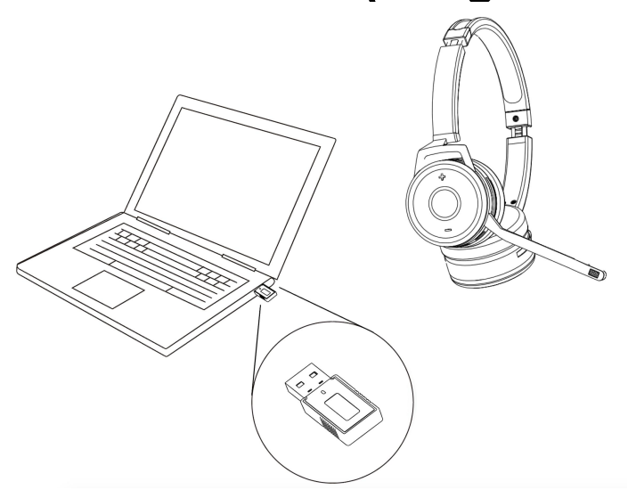
The headset and BT 100U are pre-paired and ready for use